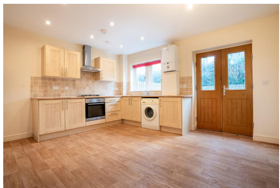
Towngate Fold Meltham, Holmfirth