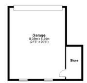
Total area: approx. 320.3 sq. metres (3447.7 sq. feet)