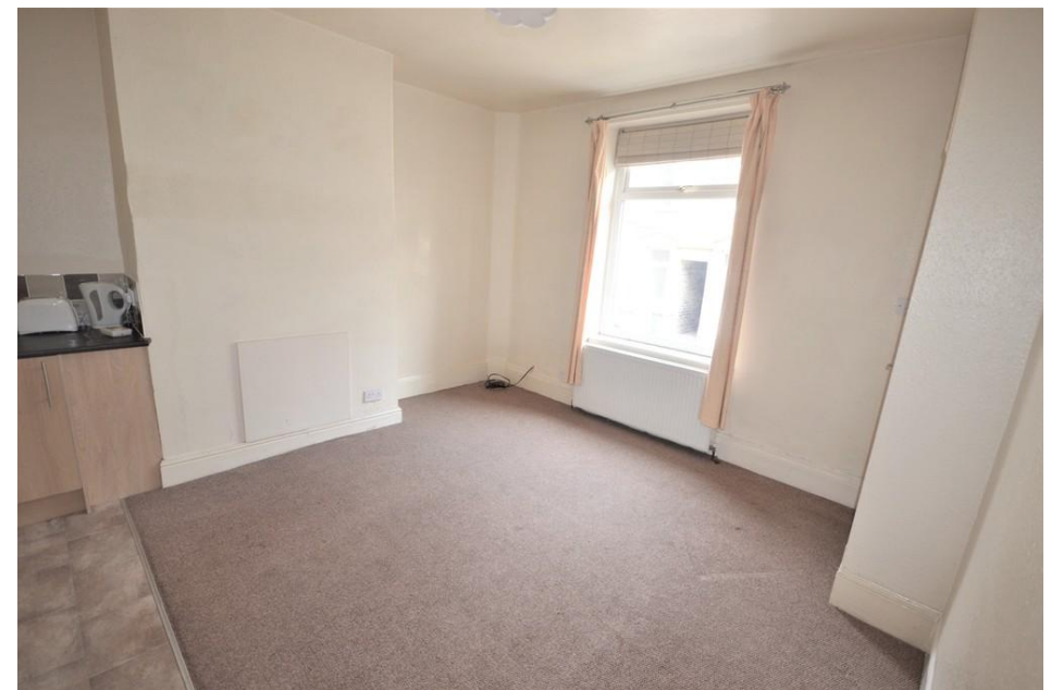
Prince Street Primrose Hill, Huddersfield